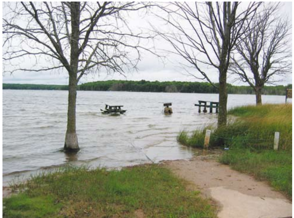
Figure 1. High water levels in Silver Lake, Barron County, flood a picnic area near the lake.

Whether your interests lie in fishing or bird-watching, lake levels can affect these, too. High lake levels are usually the result of increased runoff from more frequent or intense storms or increased ground-water recharge from prolonged periods of high rainfall. Wide fluctuations in water level and runoff can affect the species of plants and animals that can survive in and near a lake. Many plants, for example, cannot withstand being flooded for several years and then being