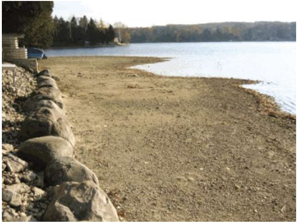
Low water levels on Crystal lake.

When monitoring lake levels, first a datum, or a reference point, must be established to which the future water levels can be compared. It is crucial that this datum be checked—by surveying—over time to ensure