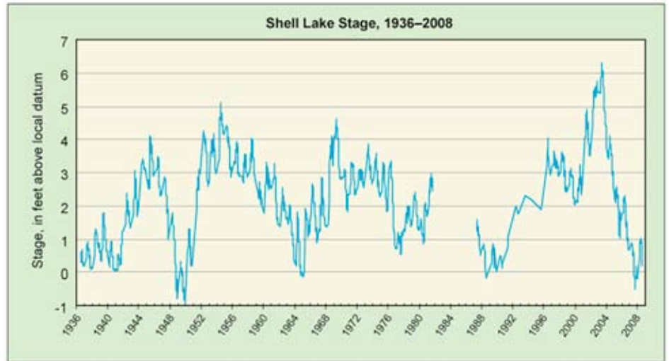
Long-term water levels for Shell Lake, Washburn County. Water-level data are available at http://www.shelllakeonline.com/the_lake_h.htm

There are many types of lakes in Wisconsin, and in turn, different factors affect their levels. Closed-basin lakes, or lakes without an outlet, are thought to be most strongly affected by changes in precipitation and experience the largest fluctuations in water level. Anvil Lake, in Vilas County, is a closed-basin lake with no inflows or outflow, and is one of a few lakes in the state with long-term water-level data. Precipitation and ground water are its main sources of water. From the 1930s to the mid-1990s, the data showed a steady decline in lake levels. But in the mid-1990s and again in 2002, the lake had very high water levels.